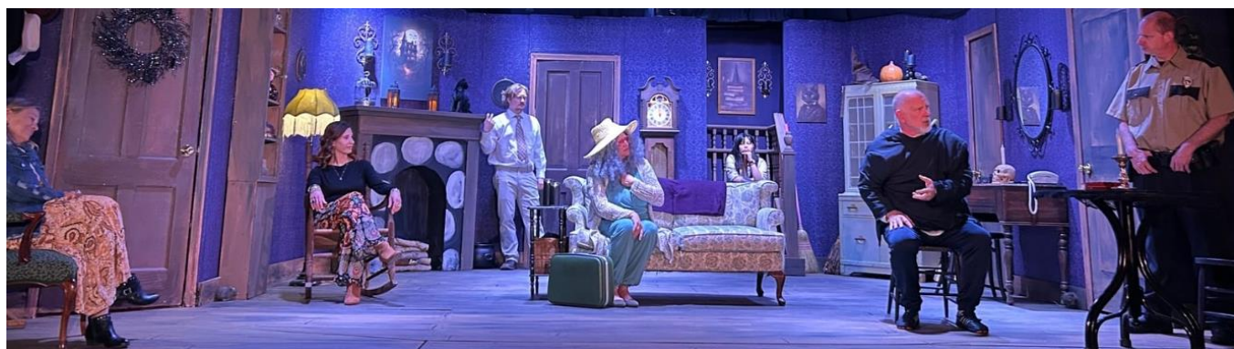
Cast of Two Witches, No Waiting